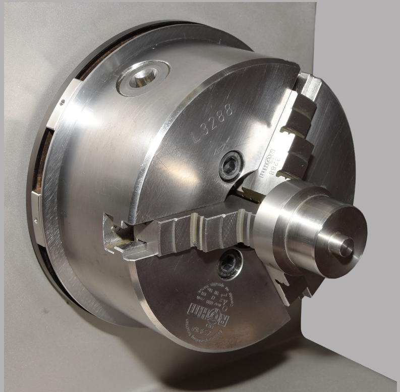
MPM balancing ring with balancing segments: 3.WRS.xxx Patented

Uneven running, low speeds and poor surfaces caused by eccentric, unbalanced workpieces?